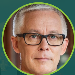
TIMO KANTOLA Consul General