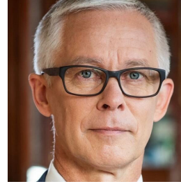
Timo Kantola Consul General of Finland to Hong Kong and Macao

Finland has once again been ranked as the happiest country in the world in the United Nations World Happiness Report 2024—for the seventh consecutive year. Happiness is not just a state of mind but the result of many factors: a well-functioning democracy, openness, equality, freedom of expression, good governance, and trust. According to the latest Transparency International survey, Finland is also the second least corrupt country in the world.